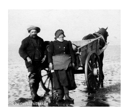
Allithwaite family out on the sands about 1900

Farming and fishing were the main occupations of the inhabitants of Allithwaite for many years. In 1841 there were 31 people in the farming industry and 9 in fishing, but many women and children went