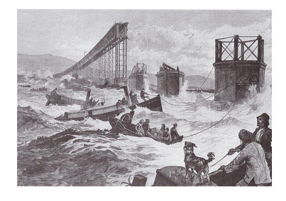
A contemporary illustration of the Tay Bridge Disaster

The Tay Bridge Disaster. In the 1870s one of Edgar's companies, Hopkins Gilkes, was involved in the construction of the illfated Tay Bridge, which collapsed in a storm on the 28th December 1879 as a train was crossing the bridge. All 75 people on board were lost. The bridge had been designed by Sir Thomas Bouch but was built by Hopkins Gilkes who also provided all the ironwork. The inquiry held after the disastrous collapse, identified problems with the design but also placed part of the blame for the collapse on substandard ironwork. The ruling of the inquiry had a major impact on the reputation of the Hopkins and Gilkes company. The Long Recession of the 1870s had already damaged the company and this added to the loss of reputation resulted in the company being wound up.