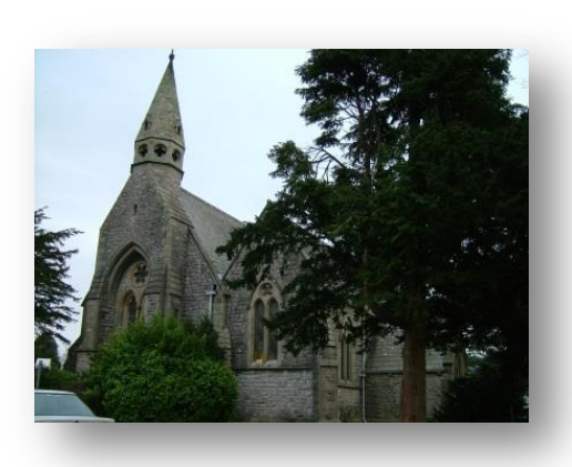
St Mary's Church Allithwaite

From the biographies recently published on the website, below is a brief synopsis of the clergy and the development of church life in Allithwaite in the 19th and early 20th century.